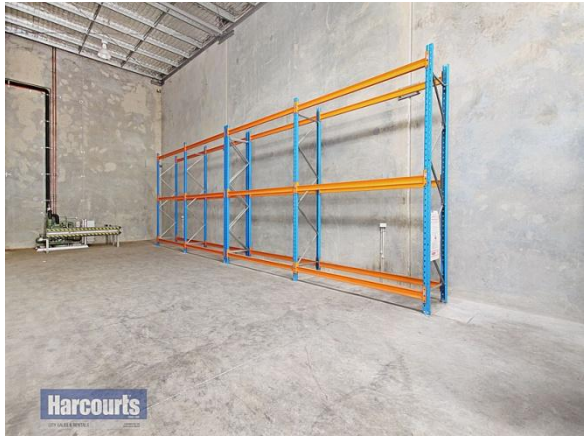
Warehouse Storage Area