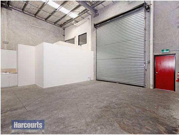
Roller Door Entrance to Warehouse