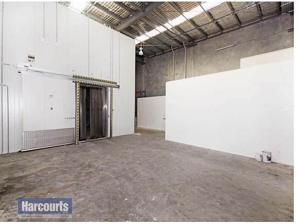
Entrance to Coldroom