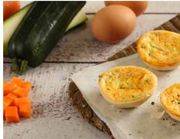
MIXED VEGGIE (V)