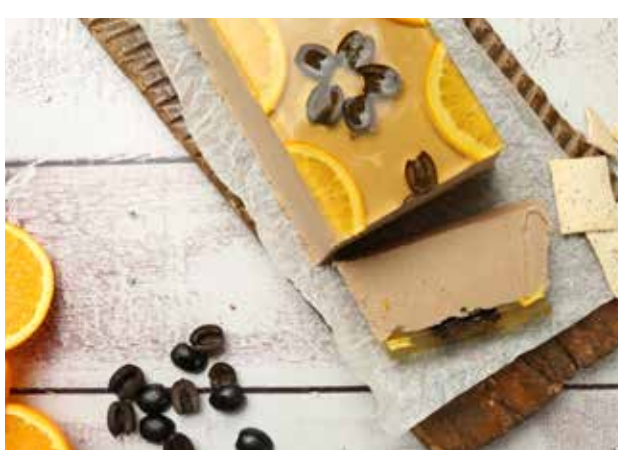
DUCK & ORANGE