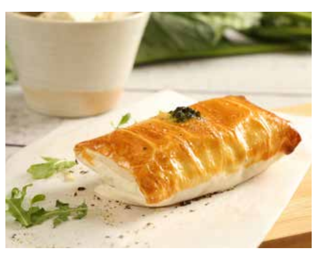
SPINACH & FETA (V)