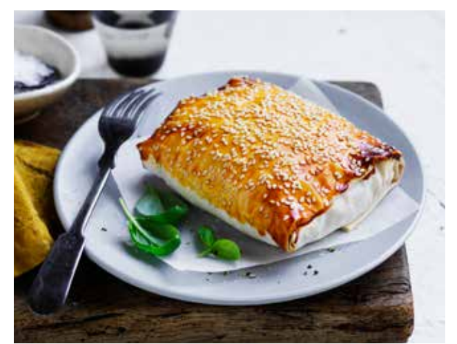
CHICKEN & MUSHROOM