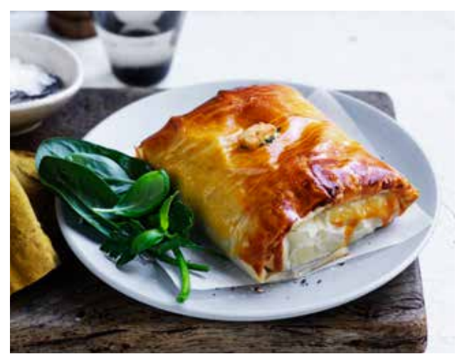
SPINACH & FETA