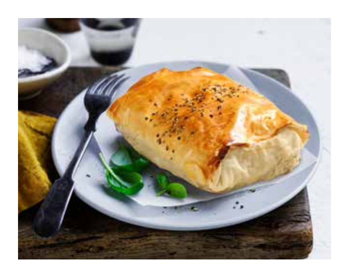
PREMIUM MINCED BEEF

One of our best sellers. Each filo is handmade with care and precision.