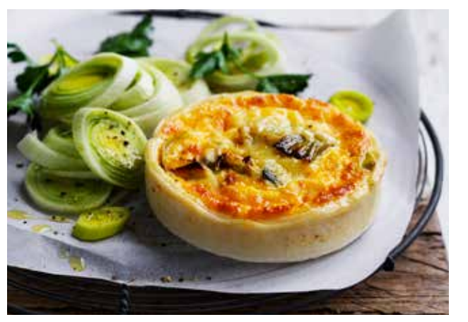
LEEK & CHEESE (V)