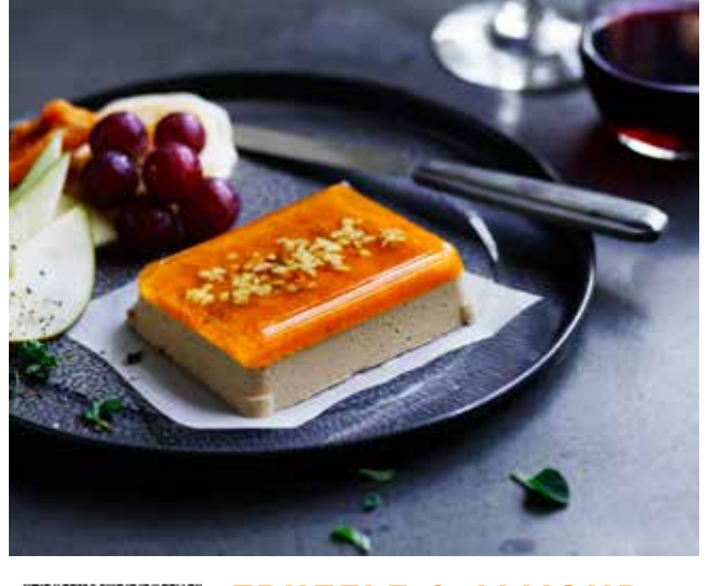
TRUFFLE & ALMOND 350710 * 000595 * SEASONAL