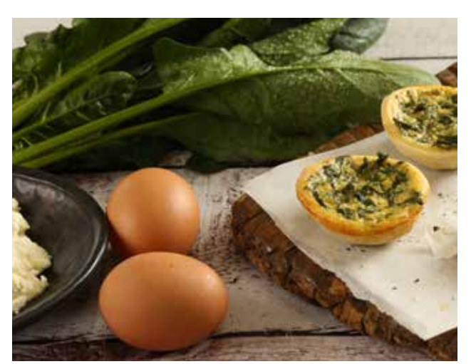
SPINACH & RICOTTA (V)