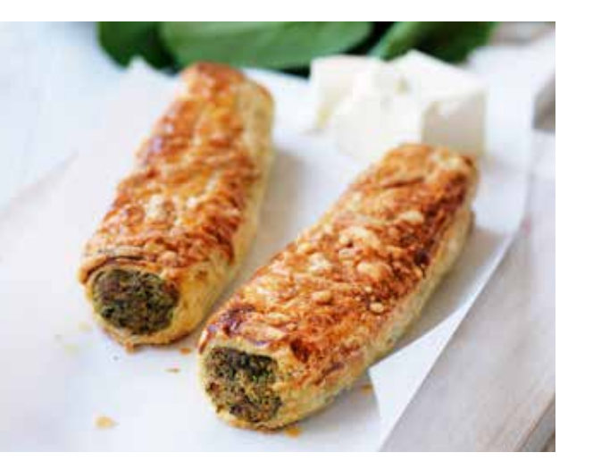
BEEF & FENNEL