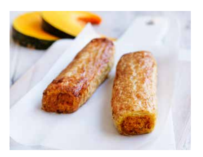
PUMPKIN, CHILLI & RICOTTA (V)