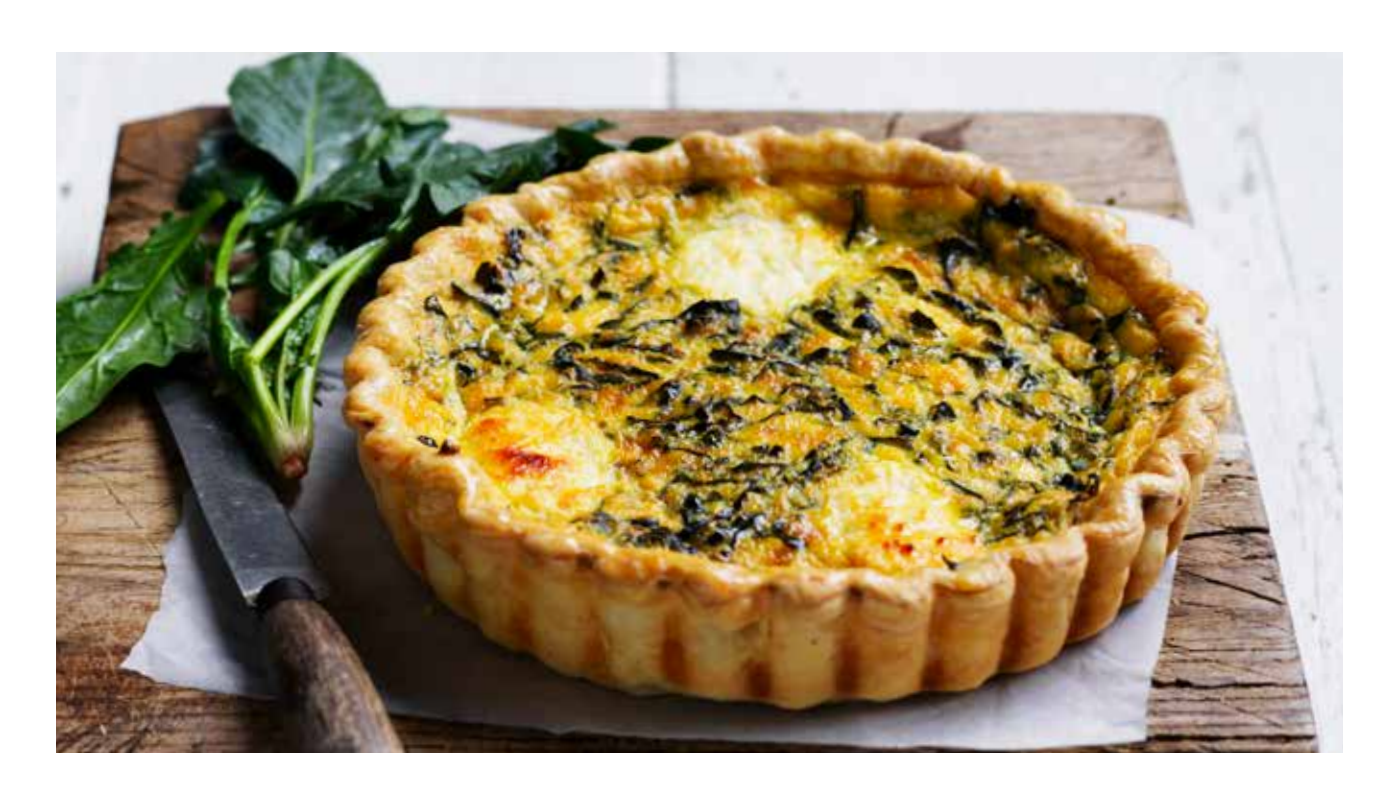
SPINACH & RICOTTA (V)

They make a convenient take-home option. Simply put in a preheated oven at 160°C for 15-25 minutes until the pastry is crisp and the filling is lusciously warm!