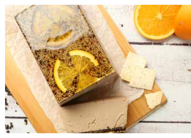
DUCK & CRACKED PEPPER