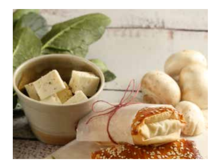
CHICKEN & MUSHROOM