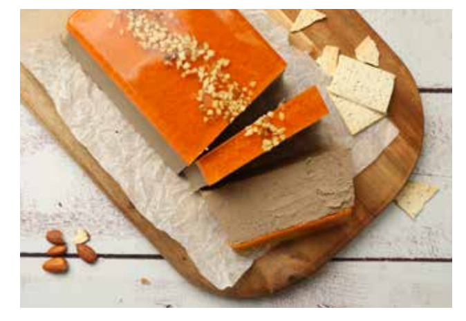
TRUFFLE & ALMOND - SEASONAL DUCK & LIMONCELLO