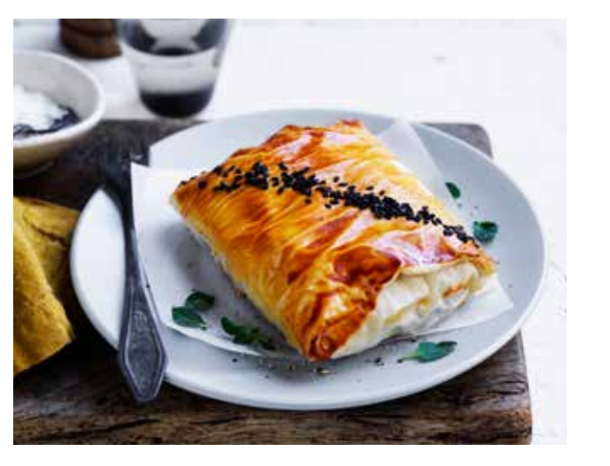
BALSAMIC PULLED PORK