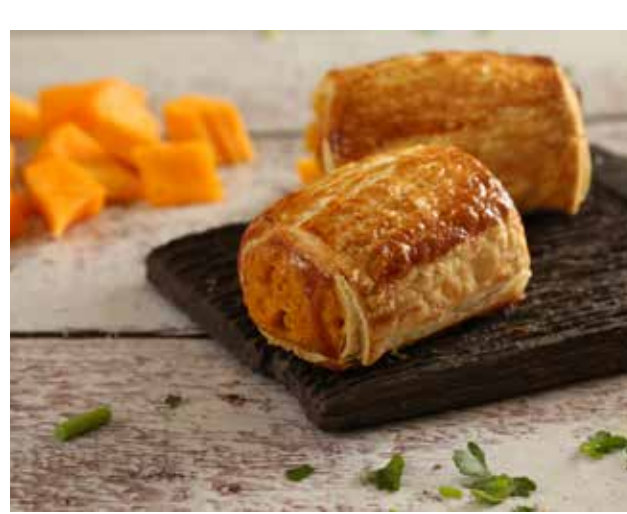
PUMPKIN, RICOTTA & CHILLI (V)