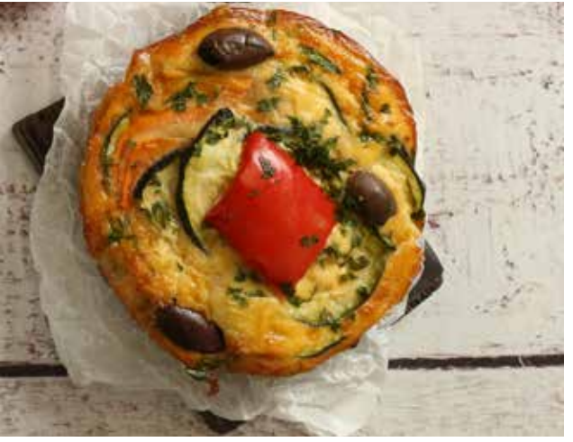
MEDITERRANEAN (V) (FL)