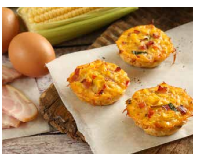
BACON, CORN & LEEK (FL)