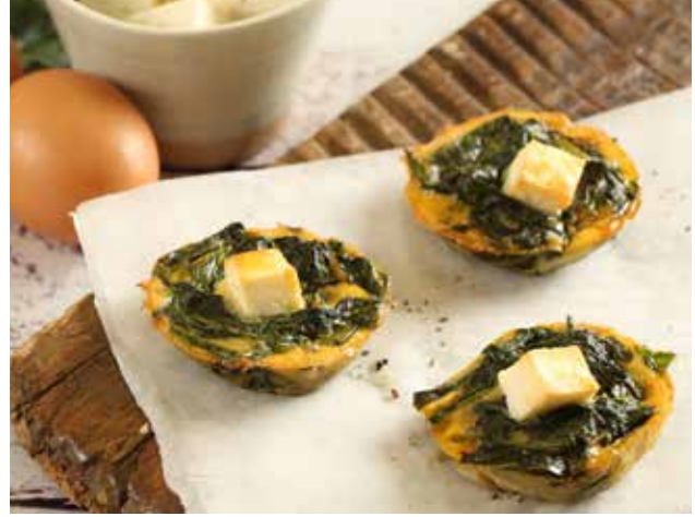
SPINACH & FETA (V) (FL)