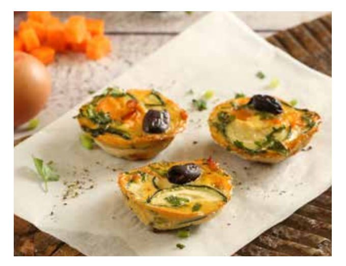
MEDITERRANEAN (V) (FL)