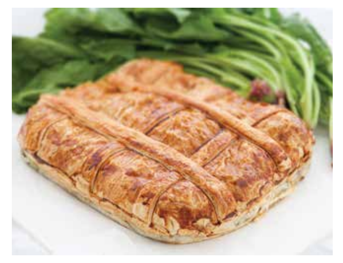
YAYA-STYLE SPINACH PIE (V)