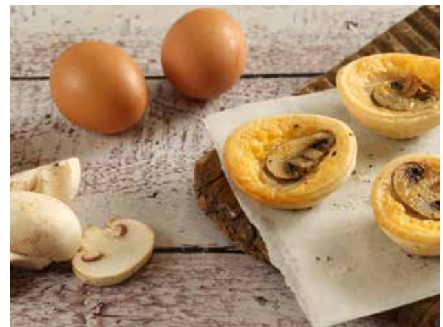
CHICKEN & MUSHROOM