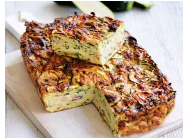
ZUCCHINI BACON SLICE