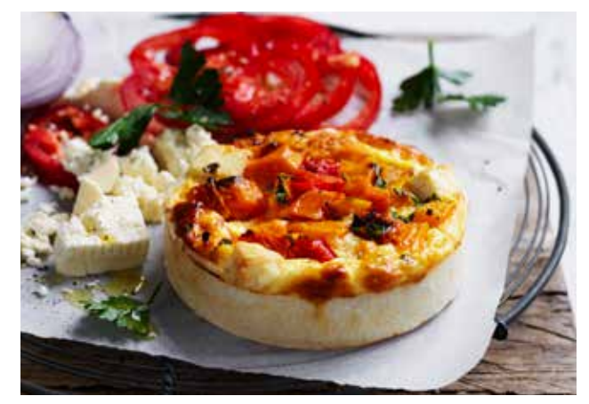
PUMPKIN, FETA & CAPSICUM (V) SPINACH & RICOTTA (V)