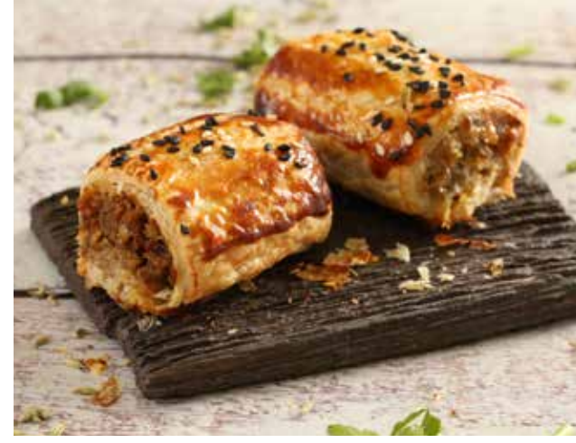
BEEF & FENNEL