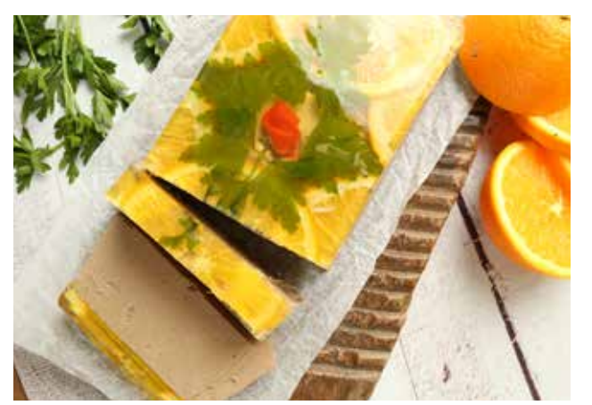
GRAND ORANGE LIQUEUR