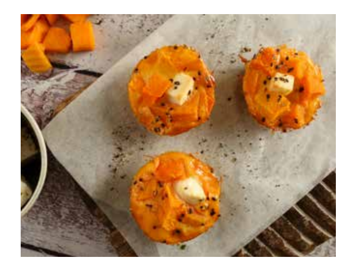
PUMPKIN & FETA (V) (FL)