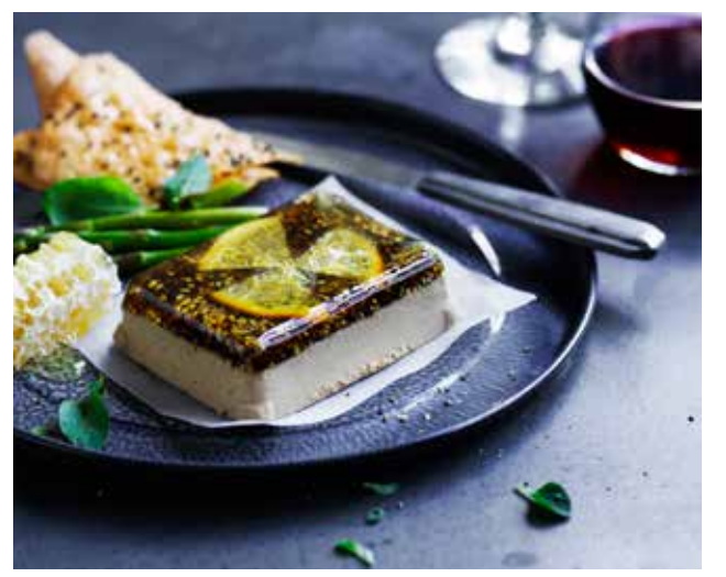
DUCK & CRACKED