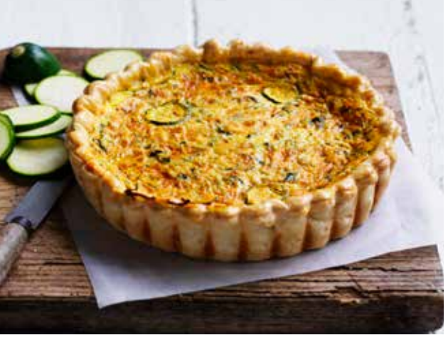
MIXED VEGGIE (V)