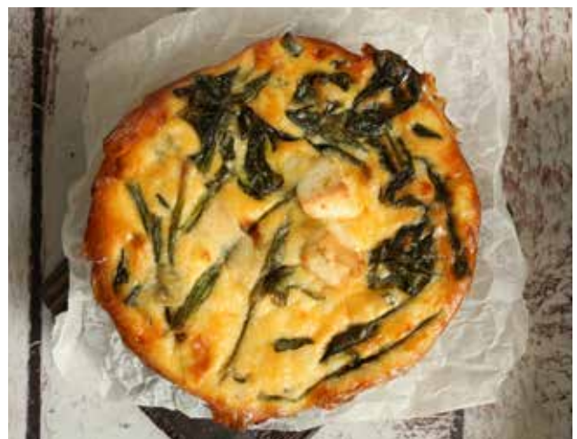
SPINACH & FETA (V) (FL)