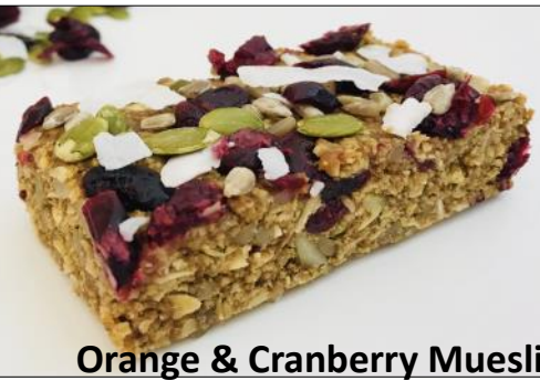
Orange & Cranberry Muesli