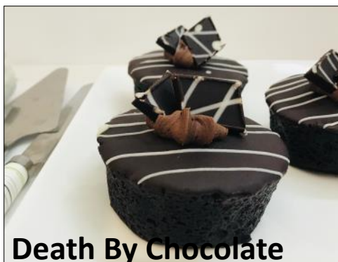
Death By Chocolate