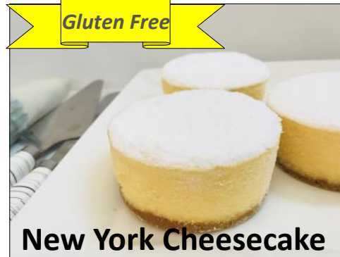
New York Cheesecake