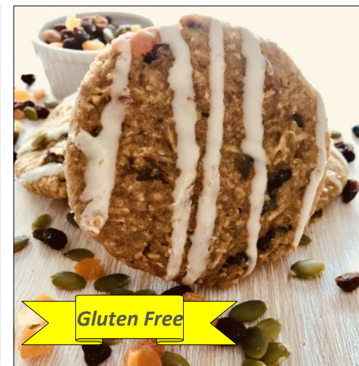
SUPERFOOD Quinoa & Apricot