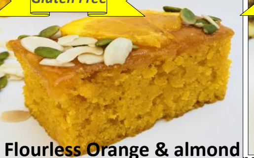
Flourless Orange & almond