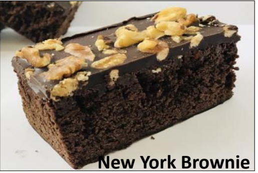
New York Brownie