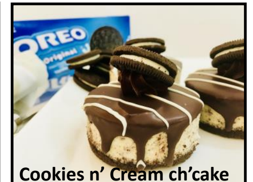
Cookies n' Cream ch'cake